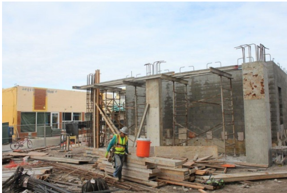
Figure 1: Restroom progress on Johnson Street