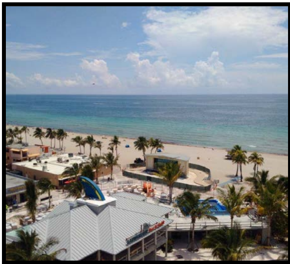
Landshark and Hollywood Beach Theatre including bike path re-route