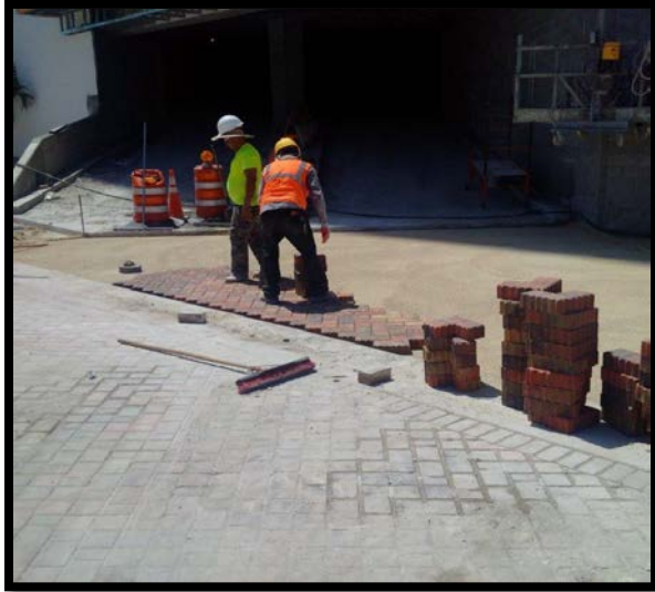
Pavers at garage entrance ramp