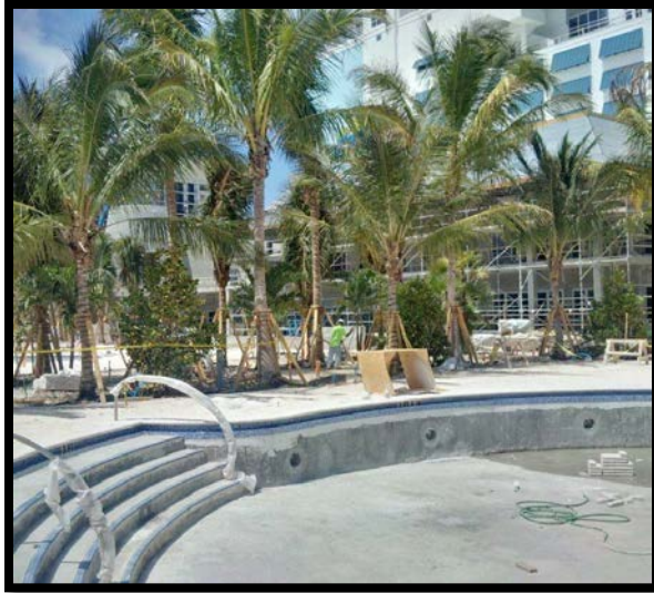
Landscaping and pool progress